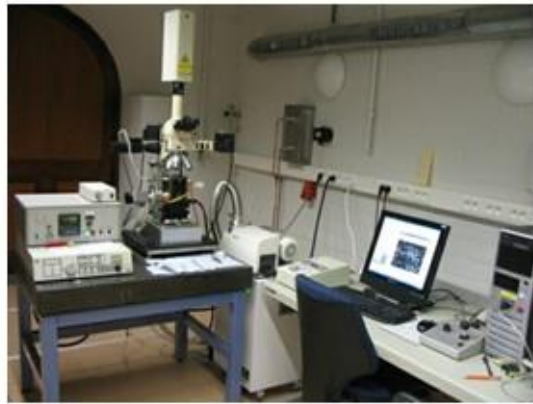
Analytical equipment & measurements